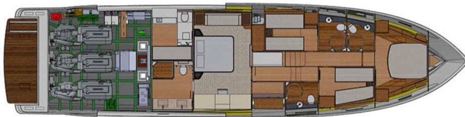
CABINS - OPTION 1