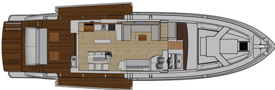
MAIN DECK - OPTION 1