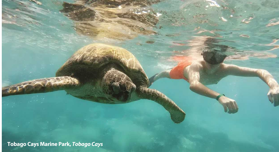
Tobago Cays Marine Park, Tobago Cays

With the Axopar, you can approach the Cays easily, drop anchor in the lee of Baradal, and swim with green turtles