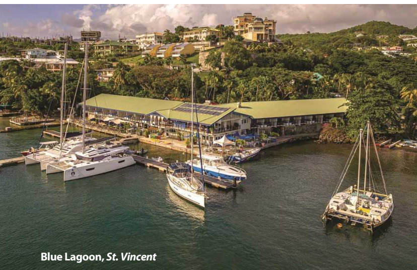
Blue Lagoon, St. Vincent

Arriving aboard the Axopar means you can skip the slow ferry and slide right into Bequia's laid-back charm. Swim off Princess Margaret Beach, browse the island's tiny but fascinating model boat shops, or grab a seaside lunch at Jack's Beach Bar. Bequia is the perfect island for long, unhurried